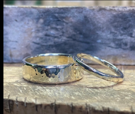
9K White Gold Plus Rhodium Plating €50

2mm: €420 3mm: €460 4mm: €520 5mm: €645 6mm: €775