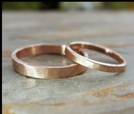
9K Rose Gold

2mm: €420 3mm: €460 4mm: €520 5mm: €645 6mm: €775