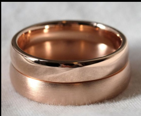
18K Rose Gold

2mm: €940 3mm: €1,050 4mm: €1,395 5mm: €1,745 6mm: €2,085