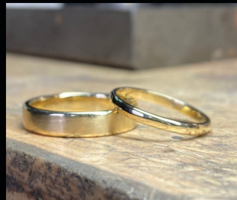
9K Yellow Gold

2mm: €380 3mm: €425 4mm: €460 5mm: €575 6mm: €690