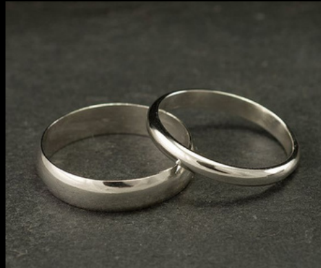
18K White Gold Plus Rhodium Plating €50

2mm: €825 3mm: €920 4mm: €1,220 5mm: €1,525 6mm: €1,825