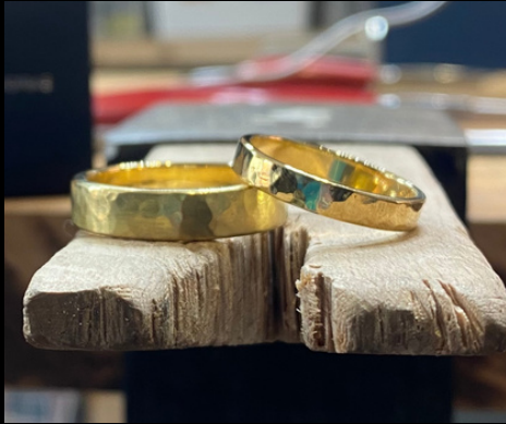
18K Yellow Gold

Please note these prices are extra and per ring.