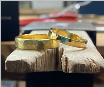
18K Yellow Gold

Please note these prices are extra and per ring.