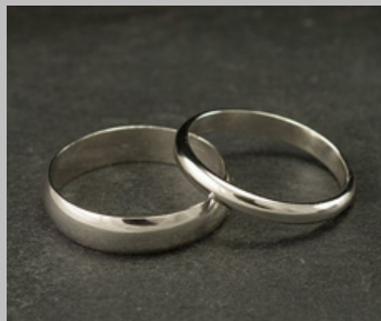
18K White Gold Plus Rhodium Plating €50

2mm: €720 3mm: €930 4mm: €1,415 5mm: €1,765 6mm: €2,115