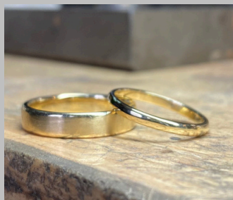
9K Yellow Gold

2mm: €330 3mm: €430 4mm: €530 5mm: €665 6mm: €795