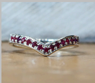
Half Eternity Pavé Set

2mm Ring (0.32cts) Natural Diamonds: €640 Lab Diamonds: €480 Rubies: €210 Sapphires: €205 Emeralds: €265