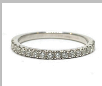
Half Eternity Castle

2mm Ring (0.14cts) Natural Diamonds: €600 Lab Diamond: €500 Rubies: €255 Sapphires: €255 Emeralds: €320