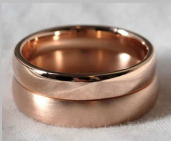
18K Rose Gold

2mm: €820 3mm: €1,060 4mm: €1,615 5mm: €1,935 6mm: €2,410