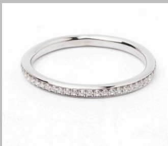
Half Eternity Pavé Set

2mm Ring (0.14cts) Natural Diamonds: €600 Lab Diamond: €500 Rubies: €255 Sapphires: €255 Emeralds: €320