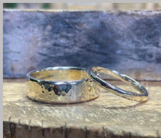
9K White Gold Plus Rhodium Plating €50

2mm: €370 3mm: €430 4mm: €595 5mm: €745 6mm: €890