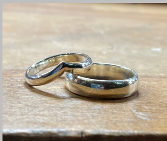
Sterling Silver Included in Workshop

Please note these prices are extra and per ring.