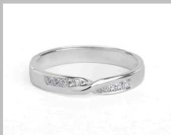
Knot Eternity Pavé

3mm Ring (0.176cts) Natural Diamond: €800 Lab Diamond: €640 Rubies: €260 Sapphires: €260 Emeralds: €325