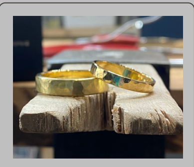
18K Yellow Gold

Please note these prices are extra and per ring.