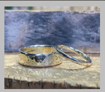
9K White Gold