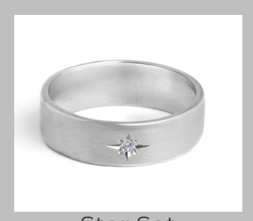
Star Set Cost Per Stone 3mm - 10mm Natural Diamonds: €40 Lab Diamonds: €35 Rubies: €35 Sapphires: €30 Emerald: €45