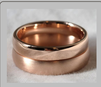
18K Rose Gold

2mm: €820 3mm: €1,060 4mm: €1,615 5mm: €1,935 6mm: €2,410