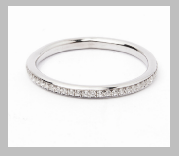
Half Eternity Pavé Set

2mm Ring (0.14cts) Natural Diamonds: €600 Lab Diamond: €500 Rubies: €255 Sapphires: €255 Fmeralds: €320