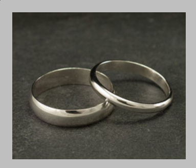
18K White Gold Plus Rhodium Plating €50

2mm: €720 3mm: €930 4mm: €1,415 5mm: €1,765 6mm: €2,115