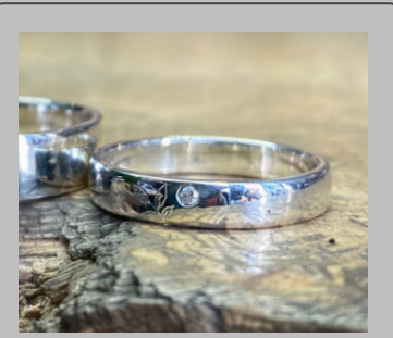
Flush Set Cost Per Stone

2mm Ring Natural Diamonds: €35 Lab Diamonds: €30 Rubies: €30 Sapphires: €25 Emerald: €40