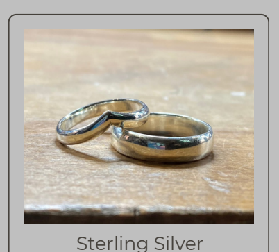
Included in Workshop

Please note these prices are extra and per ring.