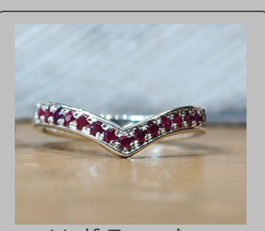
Half Eternity Pavé Set

2mm Ring (0.32cts) Natural Diamonds: €640 Lab Diamonds: €480 Rubies: €210 Sapphires: €205 Emeralds: €265