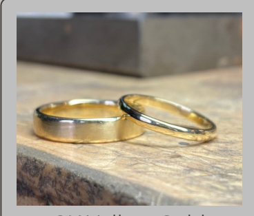
9K Yellow Gold