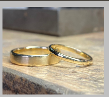
9K Yellow Gold 2mm: €335 3mm: €430 4mm: €585 5mm: €730 6mm: €875