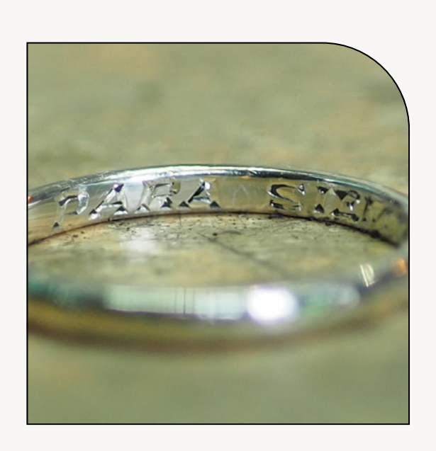
HAND ENGRAVING + 2 WEEKS