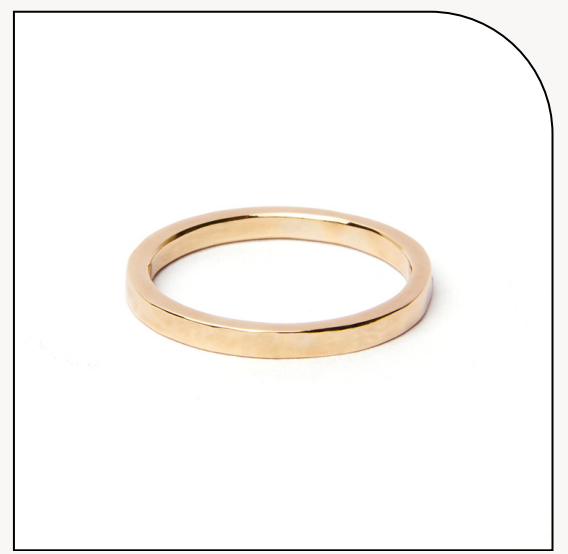
9K YELLOW GOLD