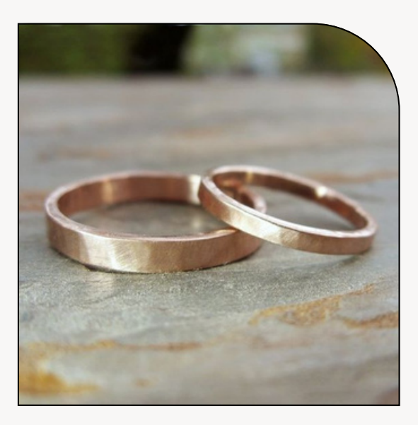
9K ROSE GOLD