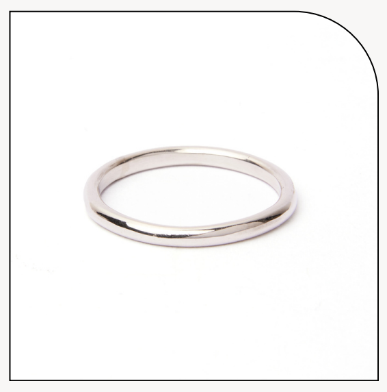
9K WHITE GOLD