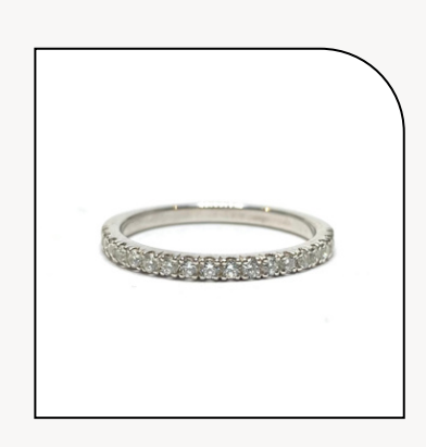
CASTLE Half Eternity 2mm Ring 0.32cts

RUBIES: €255 SAPPHIRES: €255 EMERALDS: €320