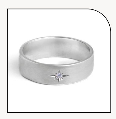
STAR 3mm - 10mm cost per stone

RUBIES: €150 SAPPHIRES: €150 EMERALDS: €220