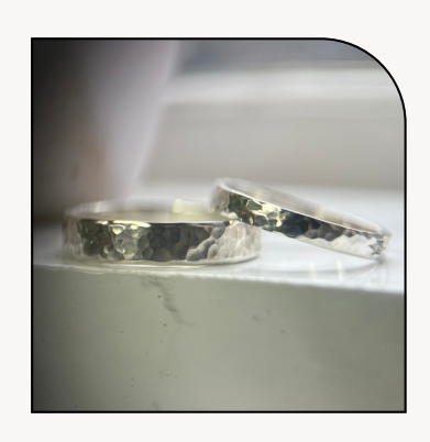
2MM - 6MM PEBBLE