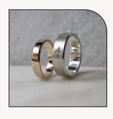
2MM - 6MM CLASSIC