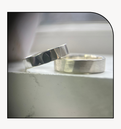
2MM - 6MM FLAT