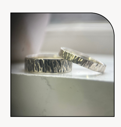
2MM - 6MM Tree bark