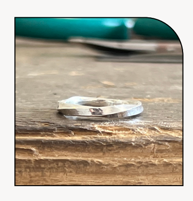
2MM SQUARE TWIST