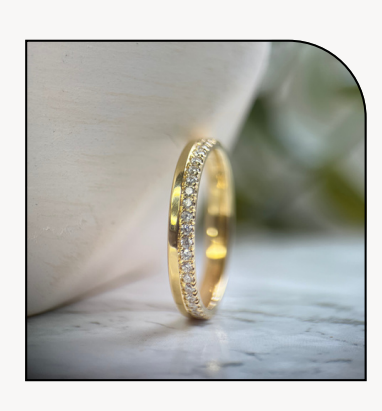
OFFSET PAVÉ Half Eternity 2mm Ring 0.14cts

RUBIES: €260 SAPPHIRES: €260 EMERALDS: €325