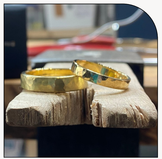
18K YELLOW GOLD