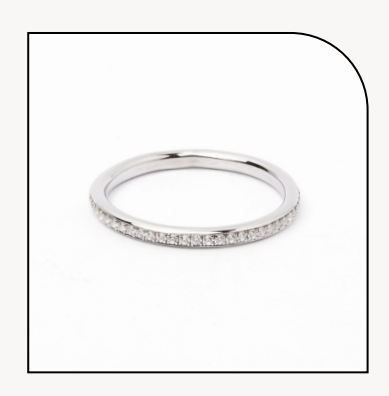
PAVÉ Half Eternity 2mm Ring 0.14cts