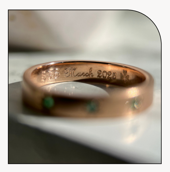
MACHINE ENGRAVING + 48 HOURS