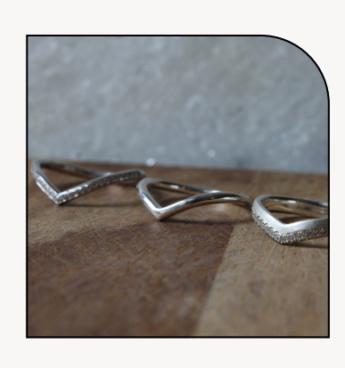
2MM - 4MM WISHBONE