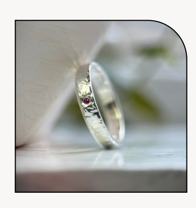
FLUSH 3mm - 4mm cost per stone

RUBIES: €35 SAPPHIRES: €30 EMERALDS: €45