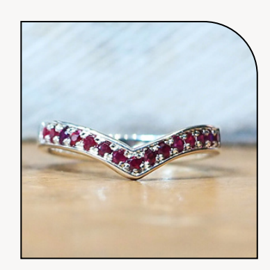
PAVÉ Half Eternity 3mm Ring 0.176cts

RUBIES: €255 SAPPHIRES: €255 EMERALDS: €320