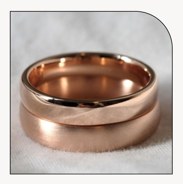
18K ROSE GOLD

2MM: €895 3MM: €1,160 4MM: €1,765 5MM: €2,200 6MM: €2,635