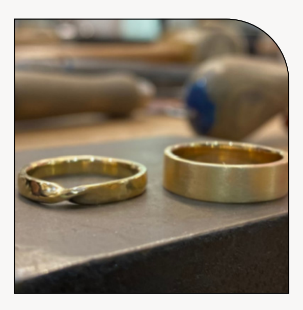
14K YELLOW GOLD