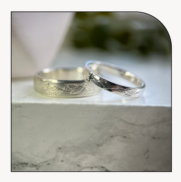
BESOKE ENGRAVING BY HAND + 2 WEEKS