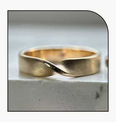
2MM - 6MM KNOT