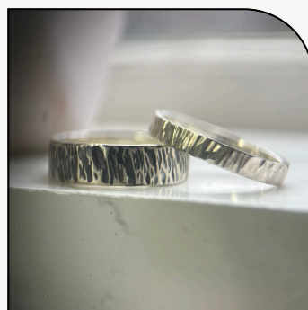
2MM - 6MM TREE BARK