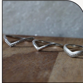
2MM - 4MM WISHBONE