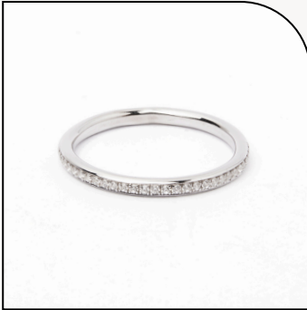
PAVÉ Half Eternity 2mm Ring 0.14cts

DIAMONDS: €600 LAB DIAMONDS: €500 RUBIES: €255 SAPPHIRES: €255 EMERALDS: €320