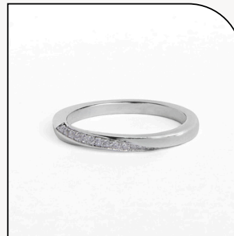
PAVÉ Twist 2mm Ring 0.075cts

DIAMONDS: €300 LAB DIAMONDS: €250 RUBIES: €135 SAPPHIRES: €135 EMERALDS: €190