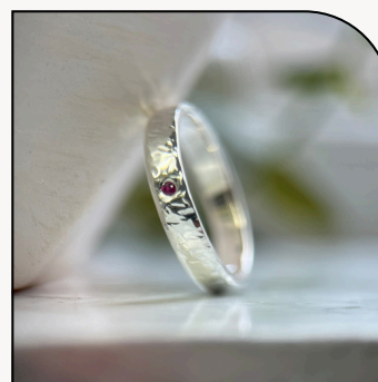
FLUSH 3mm - 4mm cost per stone

DIAMONDS: €60 LAB DIAMONDS: €45 RUBIES: €35 SAPPHIRES: €30 EMERALDS: €45