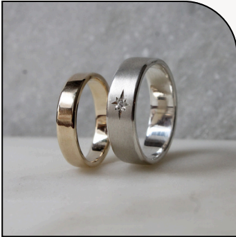
2MM - 6MM CLASSIC