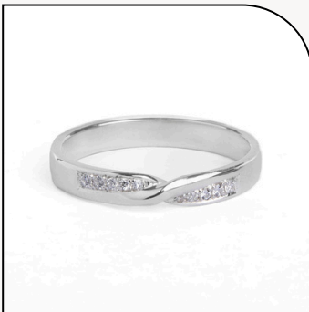
PAVÉ Knot 3mm Ring 0.072cts

DIAMONDS: €640 LAB DIAMONDS: €480 RUBIES: €210 SAPPHIRES: €205 EMERALDS: €265