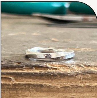
2MM SQUARE TWIST