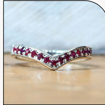
PAVÉ Half Eternity 3mm Ring 0.176cts

DIAMONDS: €600 LAB DIAMONDS: €500 RUBIES: €255 SAPPHIRES: €255 EMERALDS: €320