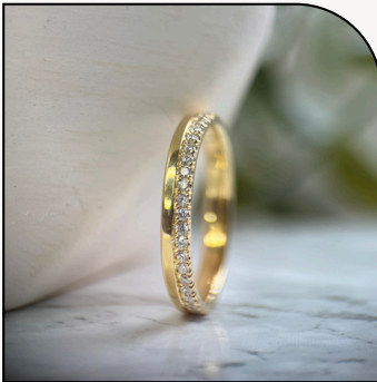
OFFSET PAVÉ Half Eternity 3mm - 6mm Ring 0.14cts

DIAMONDS: €800 LAB DIAMONDS: €640 RUBIES: €260 SAPPHIRES: €260 EMERALDS: €325