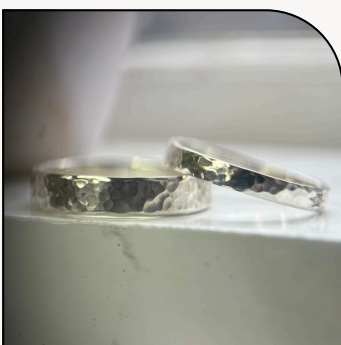
2MM - 6MM PEBBLE