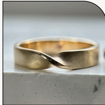
2MM - 6MM KNOT