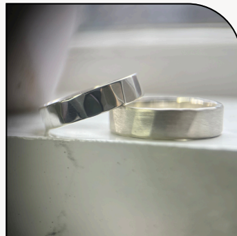
2MM - 6MM FLAT