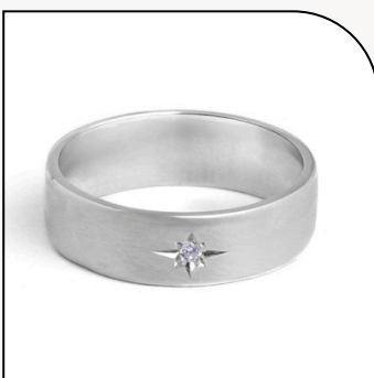
STAR 3mm - 10mm cost per stone

DIAMONDS: €400 LAB DIAMONDS: €280 RUBIES: €150 SAPPHIRES: €150 EMERALDS: €220