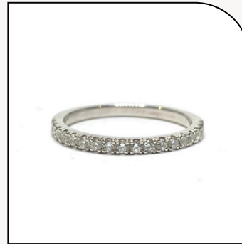
CASTLE Half Eternity 2mm Ring 0.32cts

DIAMONDS: €600 LAB DIAMONDS: €500 RUBIES: €255 SAPPHIRES: €255 EMERALDS: €320